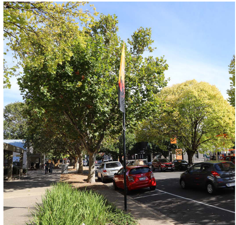
View west along Main Street Bacchus Marsh