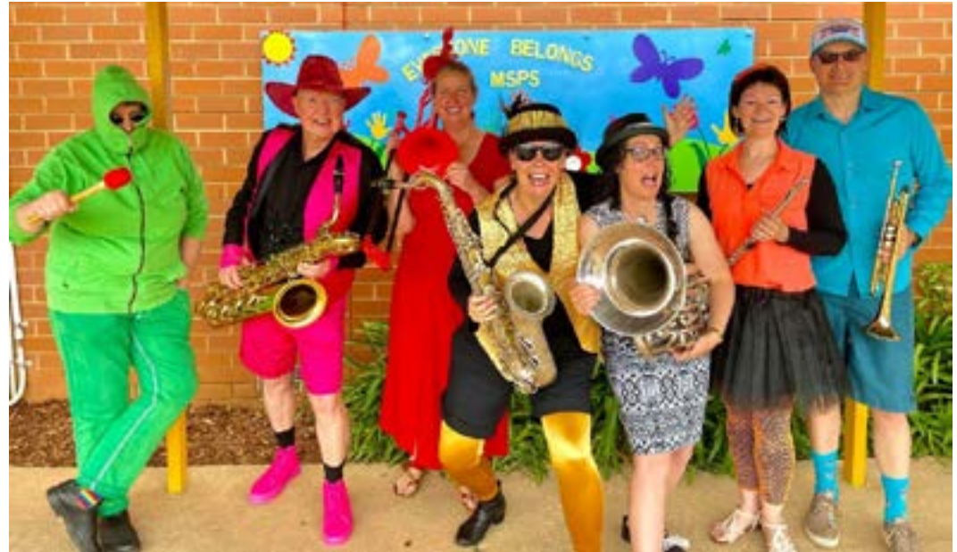
The Ballan Community Street Band were successful in applying for a Community Art & Culture Stream grant in August 2022.

We encourage you to phone Council's community development team to discuss your project idea and how it can be funded: 5366 7100.