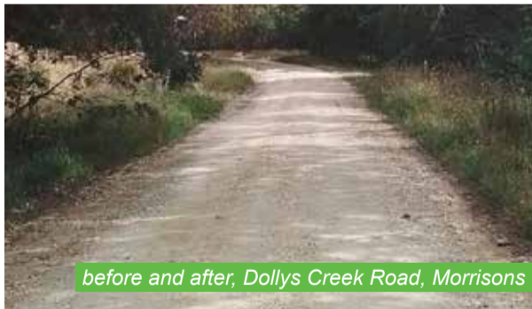
before and after, Dollys Creek Road, Morrions