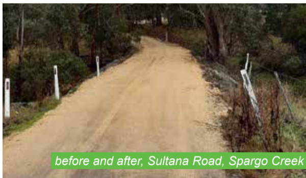
before and after, Sultana Road, Spargo Creek