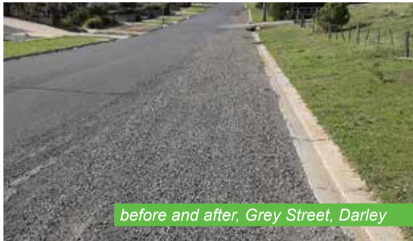
before and after, Grey Street, Darley