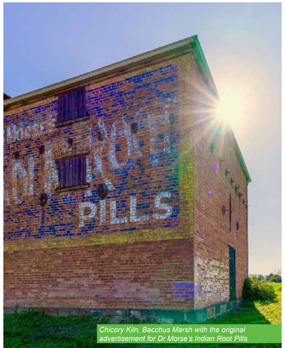
Chicory Kiln, Bacchus Marsh with the original advertisement for Dr Morse’s Indian Root Pills