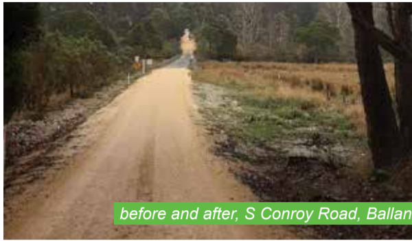
before and after, S Conroy Road, Ballan