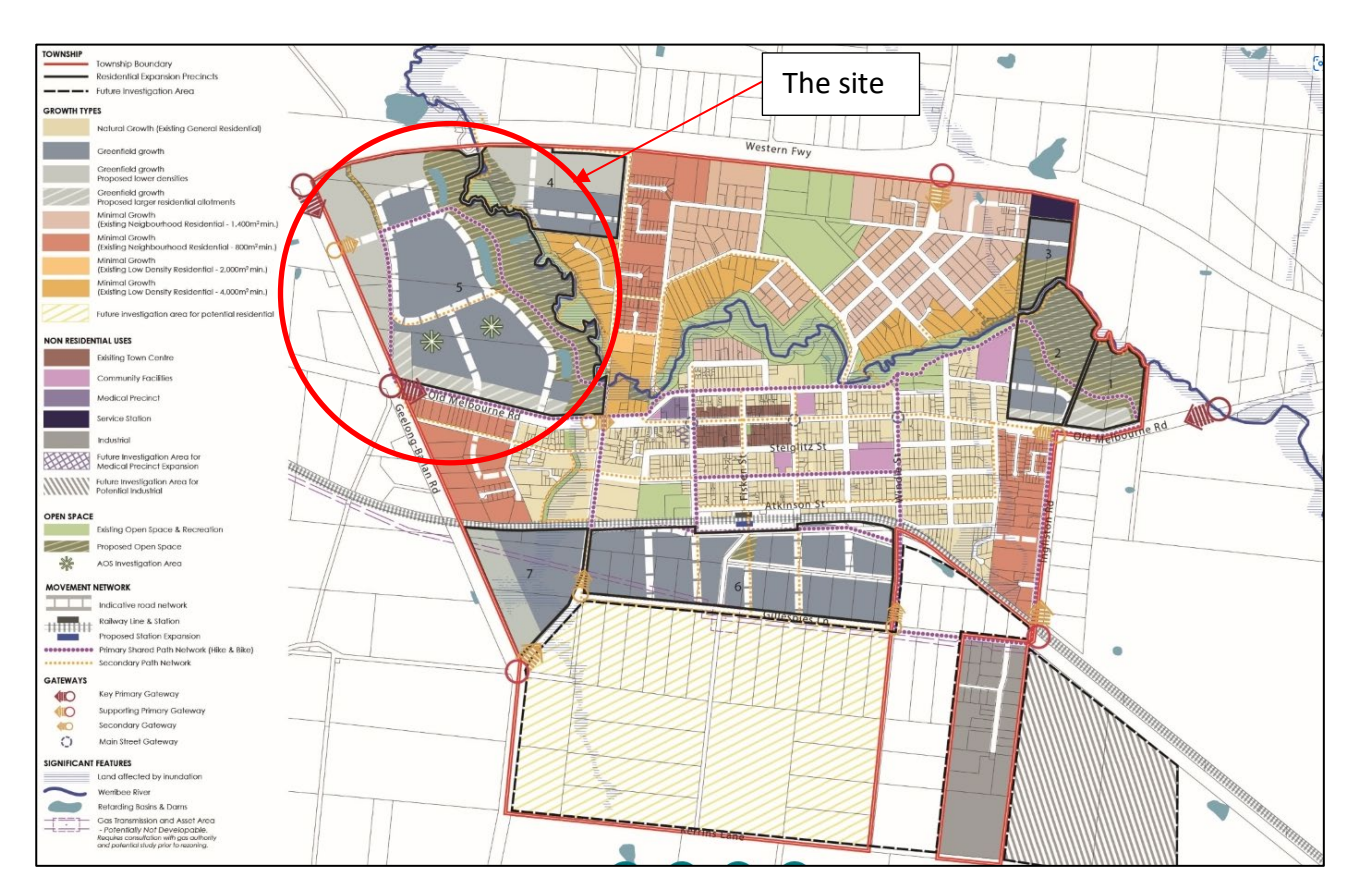
Figure 1: Ballan Framework Plan