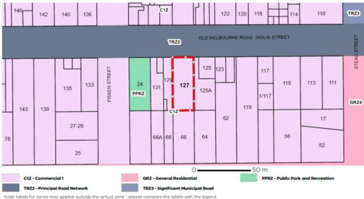
Figure 2: Zone Map