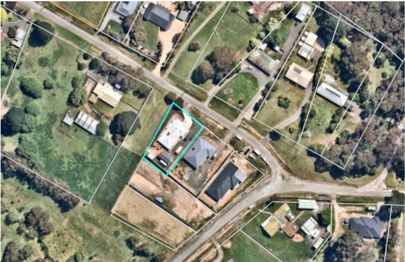
Figure 1: Aerial photograph

The site is developed with a single storey brick dwelling with a 271sqm floor area, 60sqm Colorbond shed, 9.4sqm home studio and a 14.4sqm permanent placed shipping container used for personal storage, the latter for which retrospective approval is sought as part of this current application.