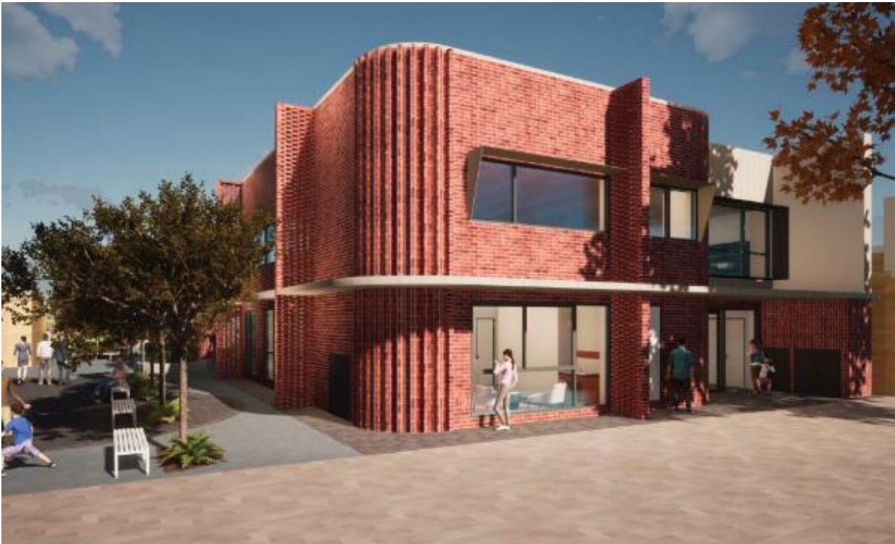
Figure 4: Photo Representation of the building from Inglis Street