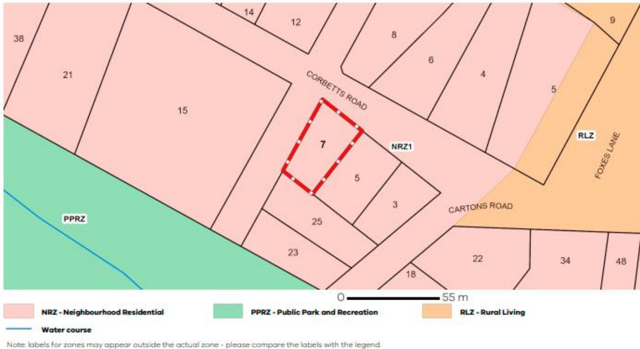
Figure 2: Zone Map

NEIGHBOURHOOD RESIDENTIAL ZONE - SCHEDULE 1 (NRZ1)