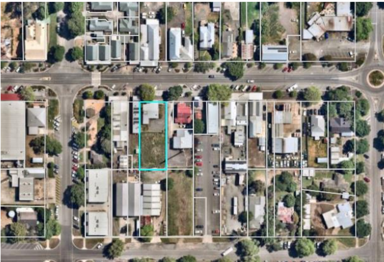
Figure 1: Aerial Photograph

access for wheelchairs. The eastern side of the site has a single car width crossover providing access to an unconstructed driveway and informal car spaces available for staff.