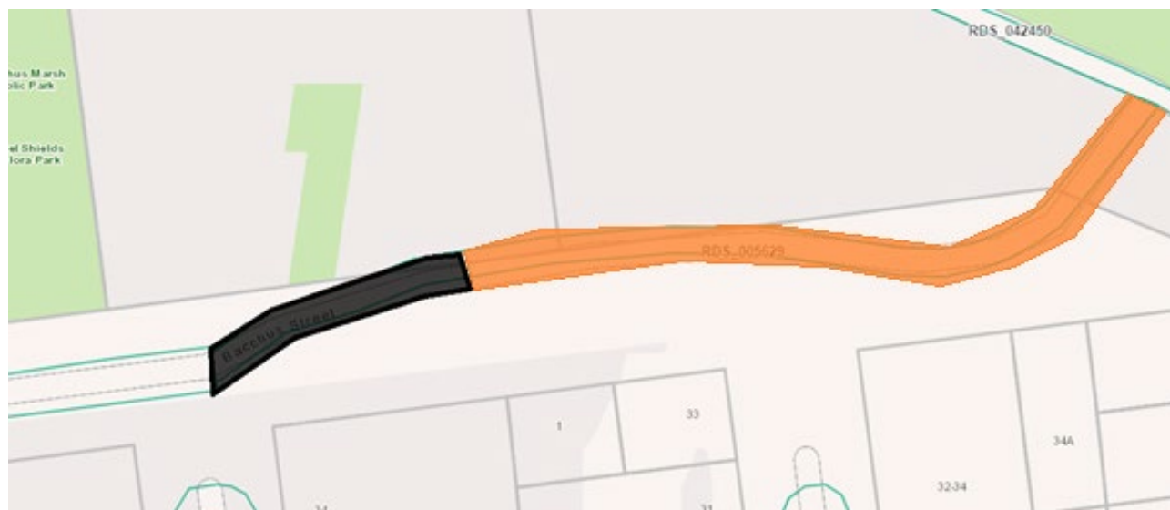
Figure 3 – Proposed road name deletion and renaming