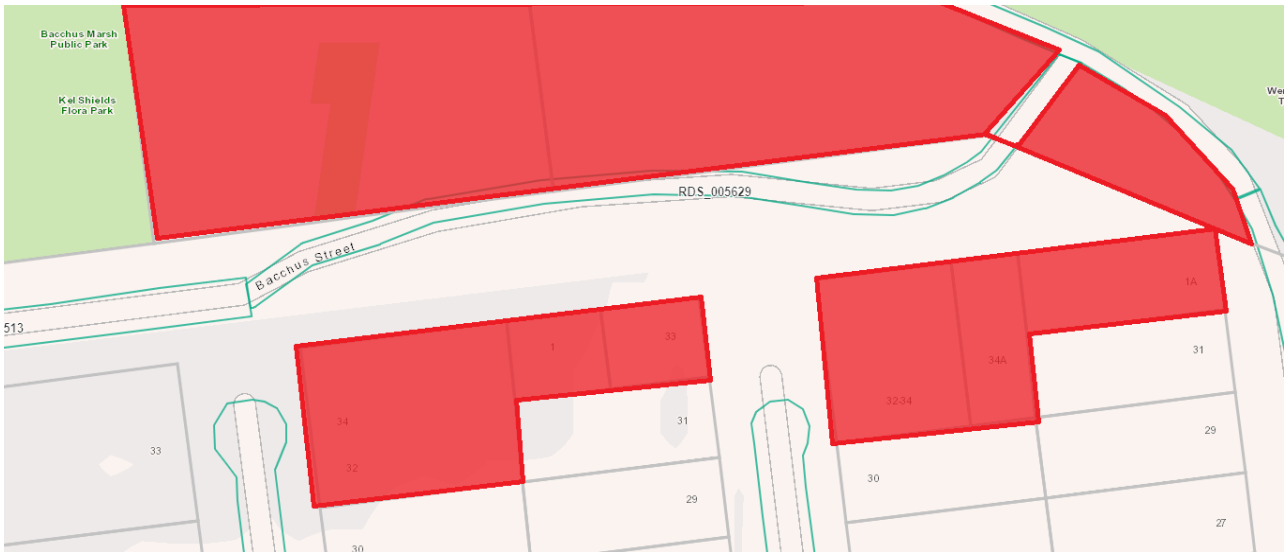
Figure 4 - Direct Consultation Area - Landowners