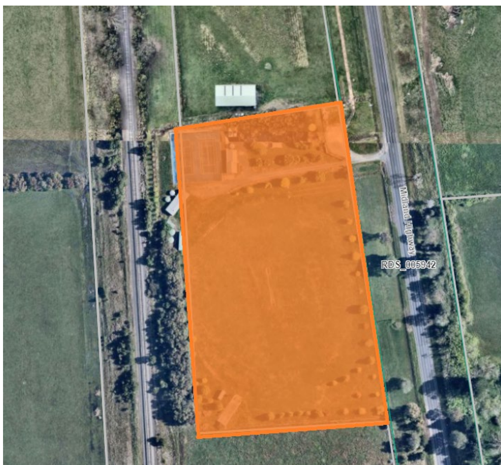
Figure 1 – Elaine Recreation Reserve