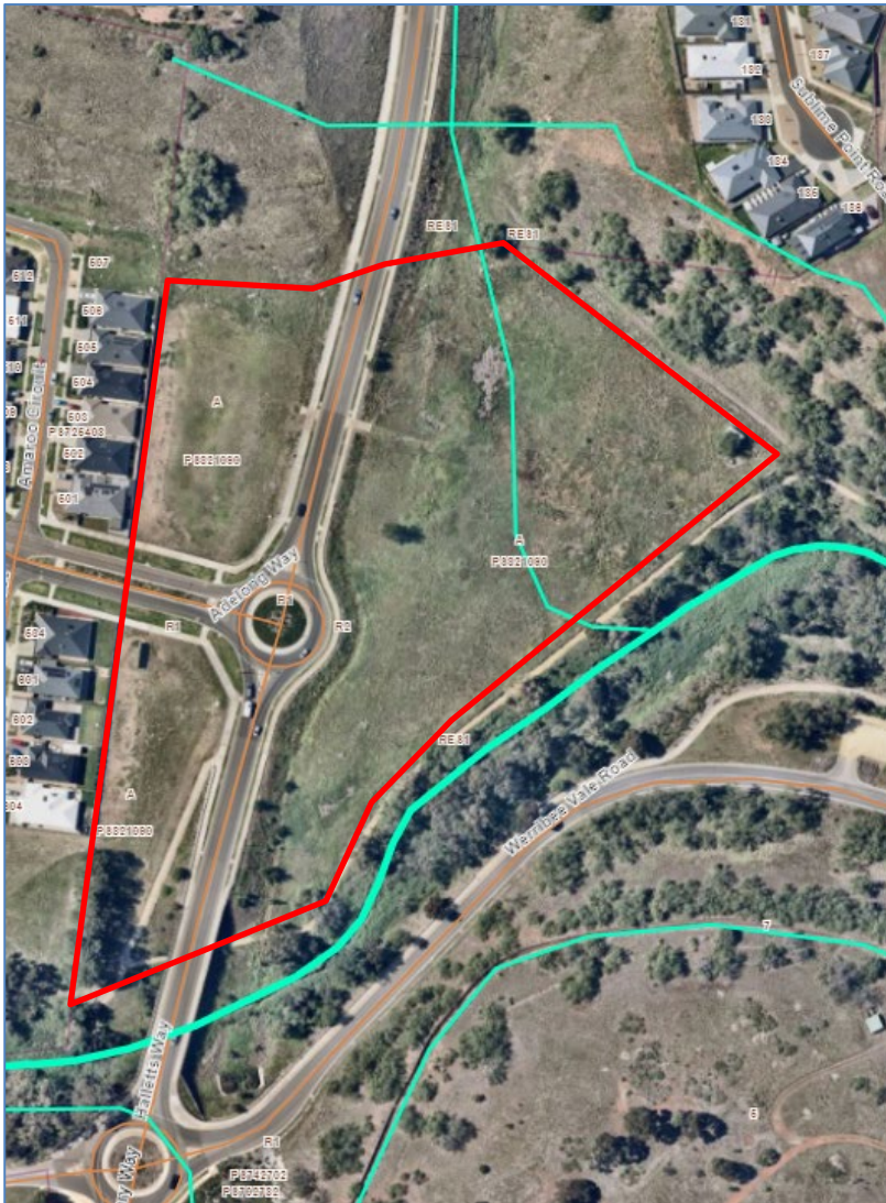
Figure 2: Site boundary overlaid on 2024 aerial image.

The subject land is relatively clear of vegetation and the western portion of the land was used for vehicle parking during construction of the Underbank Estate.