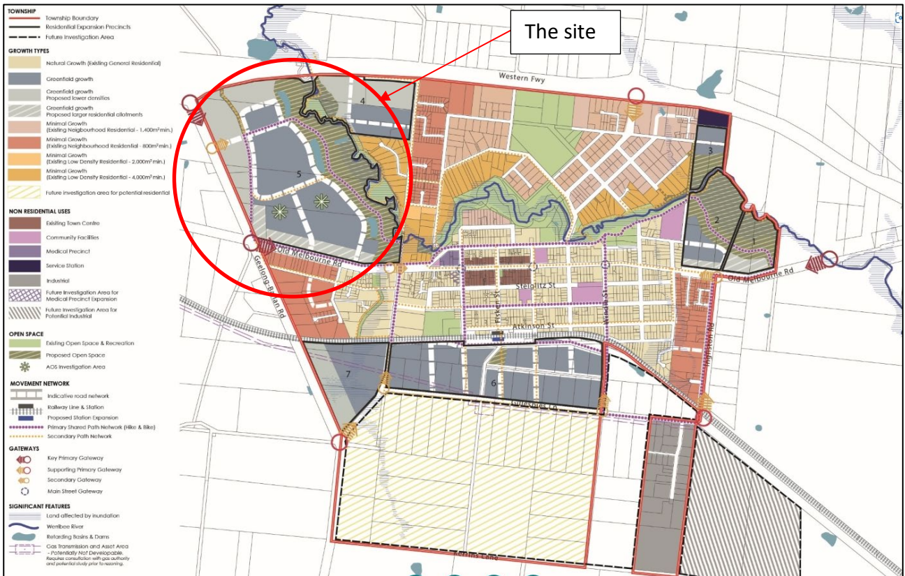
Figure 1: Ballan Framework Plan