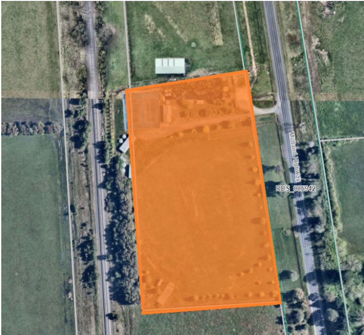
Figure 1 – Elaine Recreation Reserve

The proposal was published in April 2024 for 30 days for community consultation.